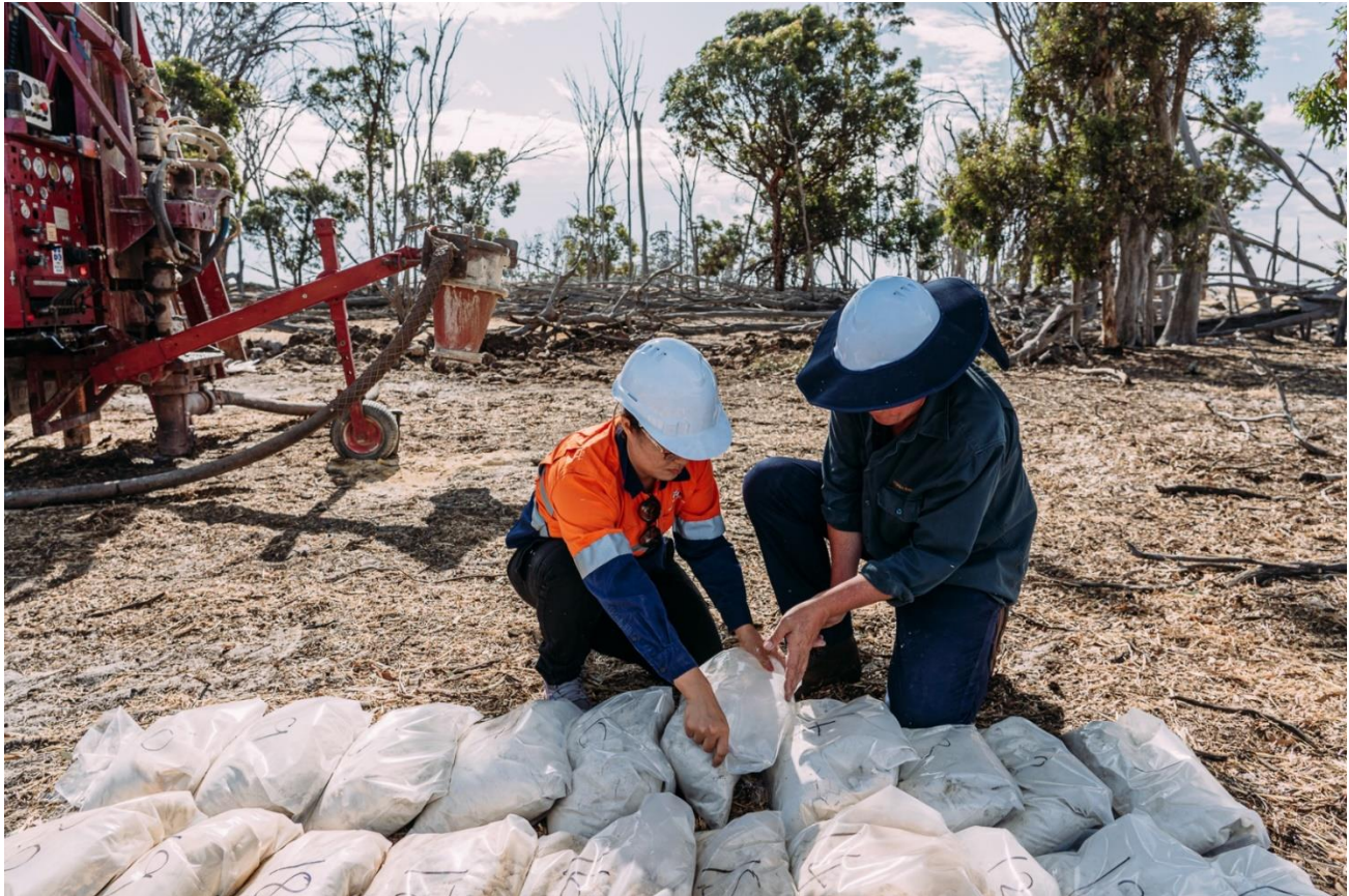
Drilling at Tambellup Kaolin Project 2020