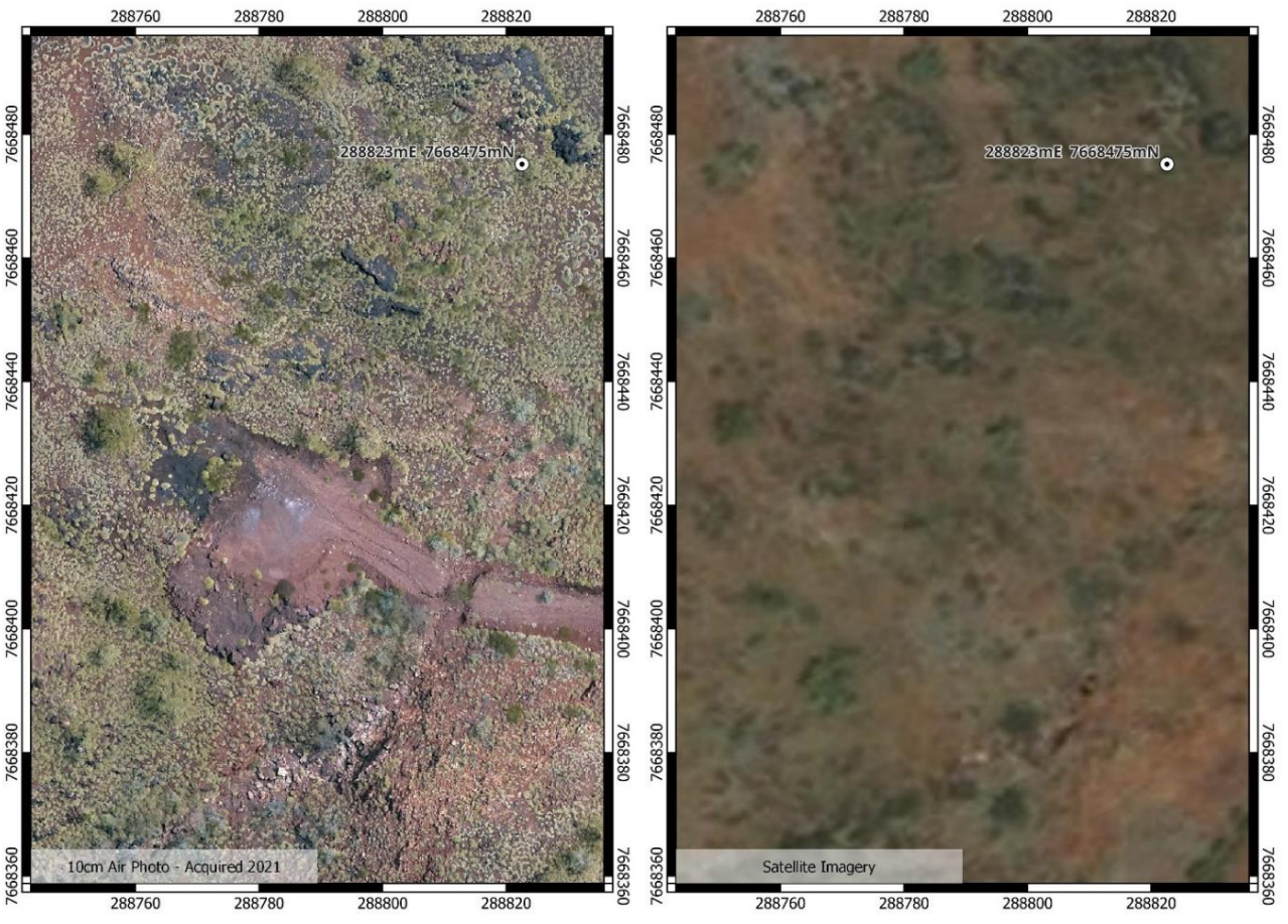
Figure 3: LiDAR Survey 10cm High Resolution Air Photo vs Satellite Imagery (14 Jan 2015)

Further work will focus on the detailed analysis and interpretation of supplied high-resolution images, with interpretation used to guide future project development. Additional field work will ground truth of the new targets generated.