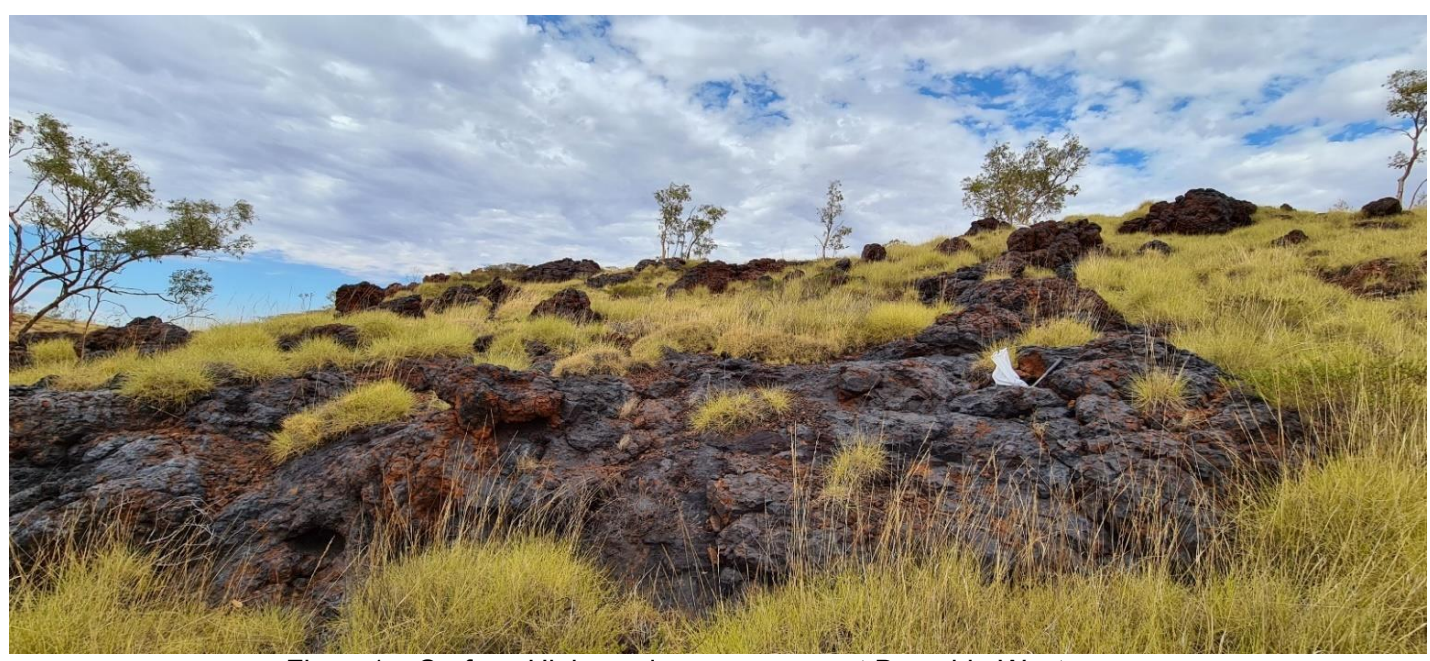
Figure 1 – Surface High-grade manganese at Braeside West