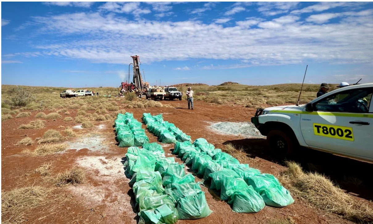
Figure 1: RC Drill Rig working at the Prinsep Lithium Project.

Accelerate Resources Limited (“AX8”, “Accelerate” or the “Company”) is pleased to provide an update on drilling progress at its 100% Prinsep Lithium project located 15km south of Karratha in the West Pilbara of Western Australia.